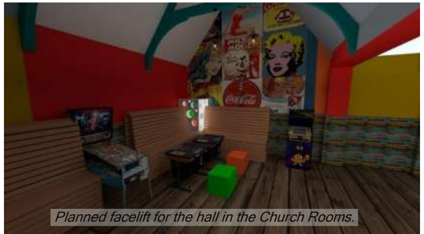
Planned facelift for the hall in the Church Rooms.

NYPP has recently secured funding from Sober Hill Wind Farm to begin the first phase of our exciting renovation project to bring the old Church Rooms into the 21st Century! The project involves a full facelift to the main hall including new lighting, furniture, and arcade games. (See illustration below.) We are also on the lookout for a bigger pool table so please get in touch if you hear of anything that might be suitable. Thank you to everyone who has provided input and feedback during our planning process.